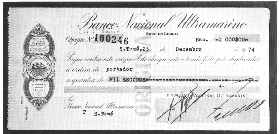
Banco Nacional Ultramarino's emergency cheque-notes of 1974, printed on ordinary cheque forms. Above: Fig. 1, 1000 escudos, 183 × 88mm. Below: Fig. 2, 500 escudos, 170 × 92mm.

"As at this moment there is an insufficient number of notes of 1000$00 and