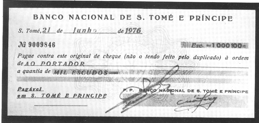
Fig. 3: Banco Nacional de S. Tomé e Príncipe’s 1976 1000 escudos cheque-note, specially printed at the Lisbon State Mint for circulation as a banknote.

The appearance of these cheques certainly contributes to coin a new word “CHEQUE-NOTE” in the glossary of notaphilic terms.